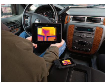
Jpload images to FLIR Tools over Wi-